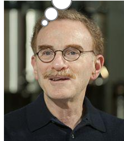
Randy Schekman Medicine nobel laureate 2013

"Just as Wall Street needs to break the hold of bonus culture, so science must break the tyranny of the luxury journals. "